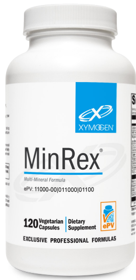
Available in 120 capsules